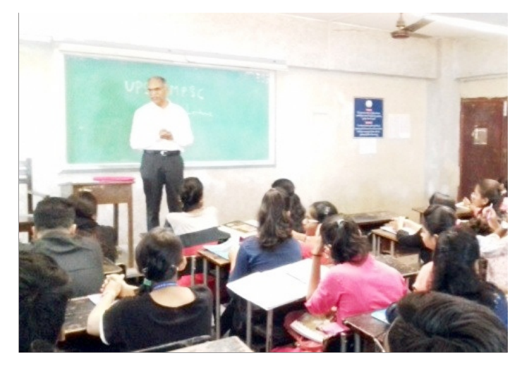
Commerce Department has started the Competitive exam MPSC/UPSC guidance lectures for all the F.Y/S.Y/T.Y.B.Com students.

S Newsletter Vol. 2 Dec - May 2019 Page No.